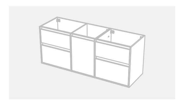
Basin range (refer to applicable basin specifications & top specifications)