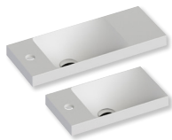
Penelope basin on 400 & 550 models - Gloss White