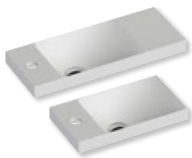
Penelope basin on 400 & 550 models - Gloss White