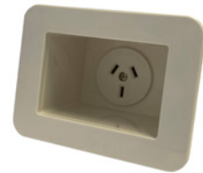
Dynamix AV-RPS01 Flush Mount Socket.