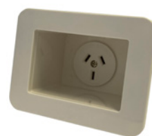
Dynamix AV-RPS01 Flush Mount Socket.